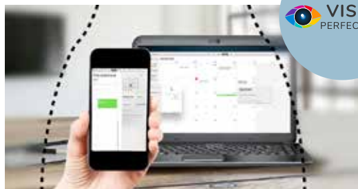
VISUAL PERFECTION 2.0