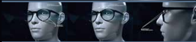
Fitting height Naso-pupillary distance Back Vertex distance